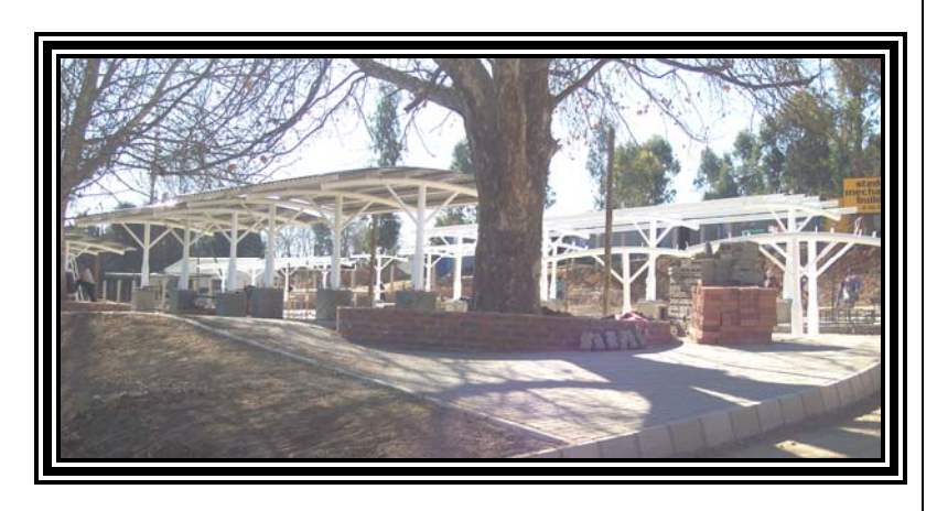
Vendor Shelters at Underberg Taxi Rank